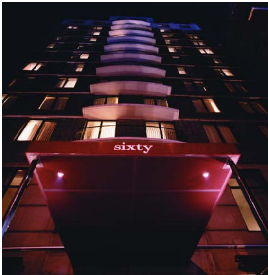
Sixty Thompson New York